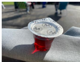
Communion at Outdoor Service