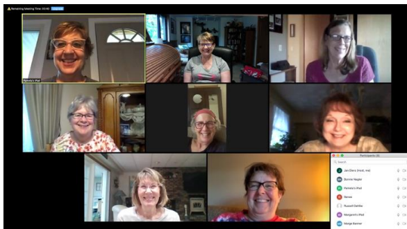
Book Club in Zoom & Outdoors