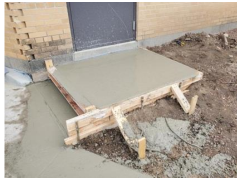
New cement doorsteps!