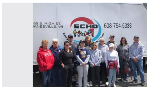
2023 CROP Hunger Walk - Asbury UMC - Janesville events.crophungerwalk.org

Below is Asbury's web page for making donations if people are interested in a head start in making donations for the cause.