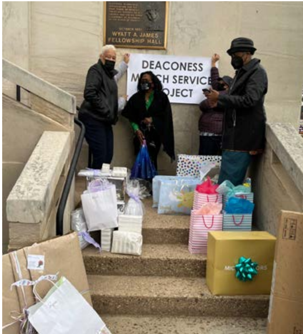
Deaconesses representing each flower team gathered at the church before delivering the donated baby items to Parkside Health Center on a very rainy April 1, 2022.

In addition to purchasing five JPMA-certified bassinets, we lovingly filled gift bags with new baby items in sizes up to 12 months. The specific gift items included: undershirts and onesie sets, baby blanket sets, bassinet sheets, washcloths, towels, baby bibs, receiving blankets, baby caps/hats, baby bottles and nipples, socks, leggings, booties, bath items, sleep sacks to decrease sudden infant death syndrome (SIDS), baby thermometers, and boxes of diapers.